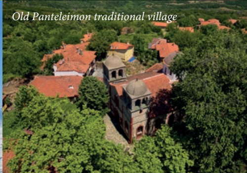
Old Panteleimon traditional village