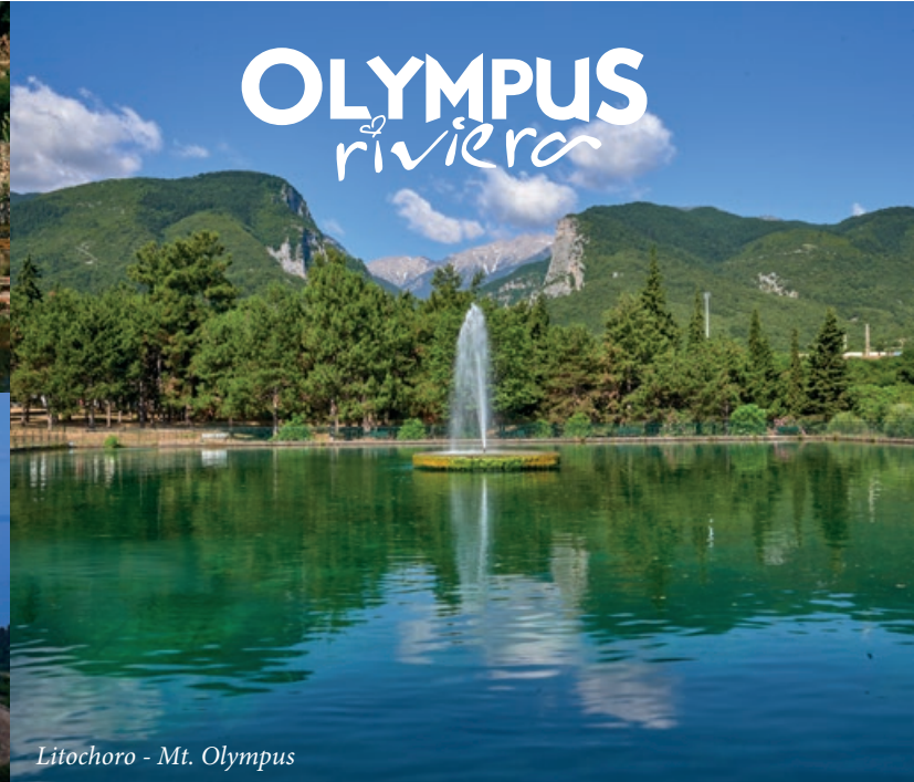
Litochoro - Mt. Olympus

Litochoro is a holiday destination, situated 24 km south of Katerini and it's one of the most picturesque towns in the land of Mt Olympus. Locals tend to call it "The Gate of the Greek Gods' abode" as it is built on the slopes of Mount Olympus. In a unique way, It combines the sea with the mountain. The view from the town to the peaks of Olympus is magnificent, while the coast has a large number of tourist facilities and holiday villages that attract large volumes of visitors, both Greeks and foreigners throughout the year.