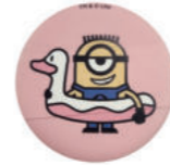
TPU Band-Type puff

Designs can be printed under the ribbon and a logo can be inserted on the ribbon.