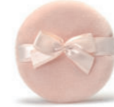
New Polyester Puff

This puff is perfect for light finish makeup and is often used for no-sebum powders due to its economic price.