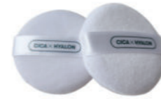
Micro Fiber Puff

It can be made into various sizes and shapes per the container's size. We can make it into either economically price sealing type or premium hand-made type.