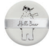
Digital Print Puff

Designs can be printed under the ribbon and a logo can be inserted on the ribbon.