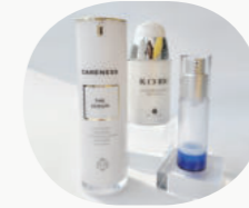
Airless Pump Container