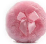
Fluffy Powder Puff

This is an eco-friendly puff that is made of recycled plastics