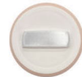
Whole Rubycell TPU Puff

Soft and premium design by using Rubycell instead of PU material.