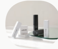
Stick & Lip Container