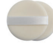
Flocked Foam Puff

This puff has a slightly longer pile than micro fiber (choose from 2 or 3 mm pile length).