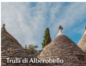
Trulli di Alberobello