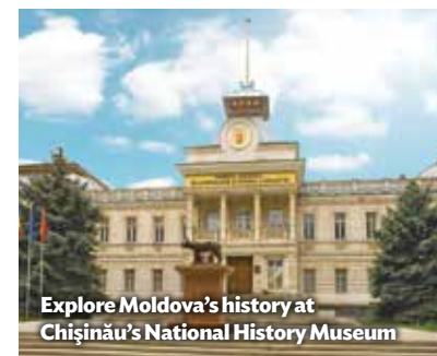
Explore Moldova's history at Chişinău's National History Museum

'Moldova's National Wine Day celebrates the country's wine culture with music, tastings and open cellar events'