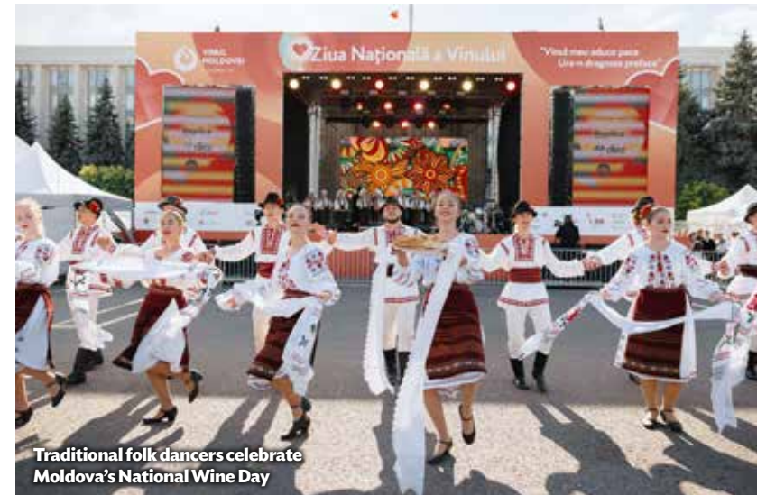
Traditional folk dancers celebrate Moldova's National Wine Day

Alternatively, cycle through the landscape on one of the region's bike routes or explore the river Nistru (Dniester/Dniester) by kayak,