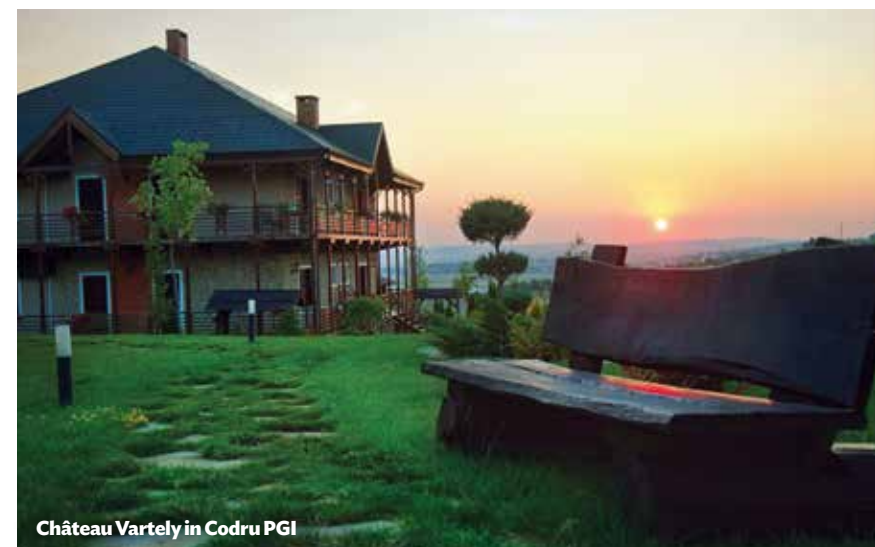
Château Vartely in Codru PGI

From rustic, skin-contact, natural wine styles made in small quantities, to a rise in biodynamics and traditional approaches such as foot treading, winemaking in