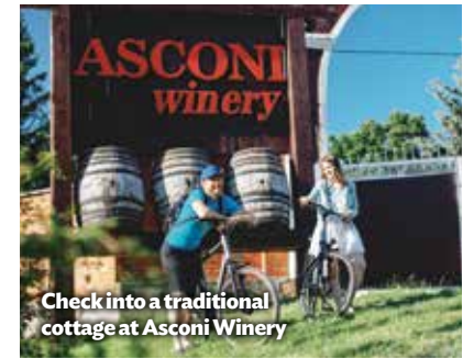
Check into a traditional cottage at Asconi Winery

Tour the vineyards and winery at nearby Château Purcari , one of Moldova's oldest and most prestigious wineries. Here you can taste famed wines including Negru de Purcari (a favourite of Queen Victoria) or the poignant Georgian-Moldovan-Ukrainian Freedom Blend . After a few hours boating or fishing on the Nistru, or