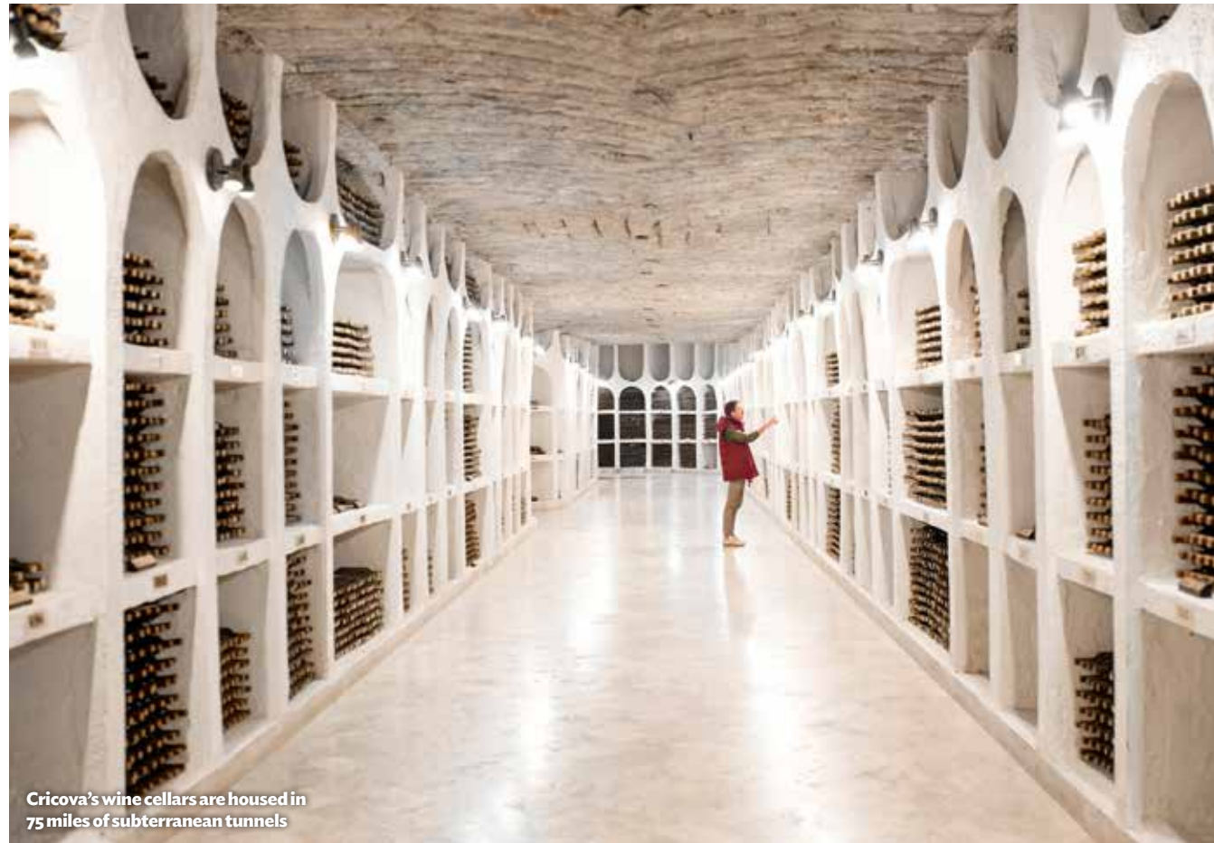
Cricova's wine cellars are housed in 75 miles of subterranean tunnels