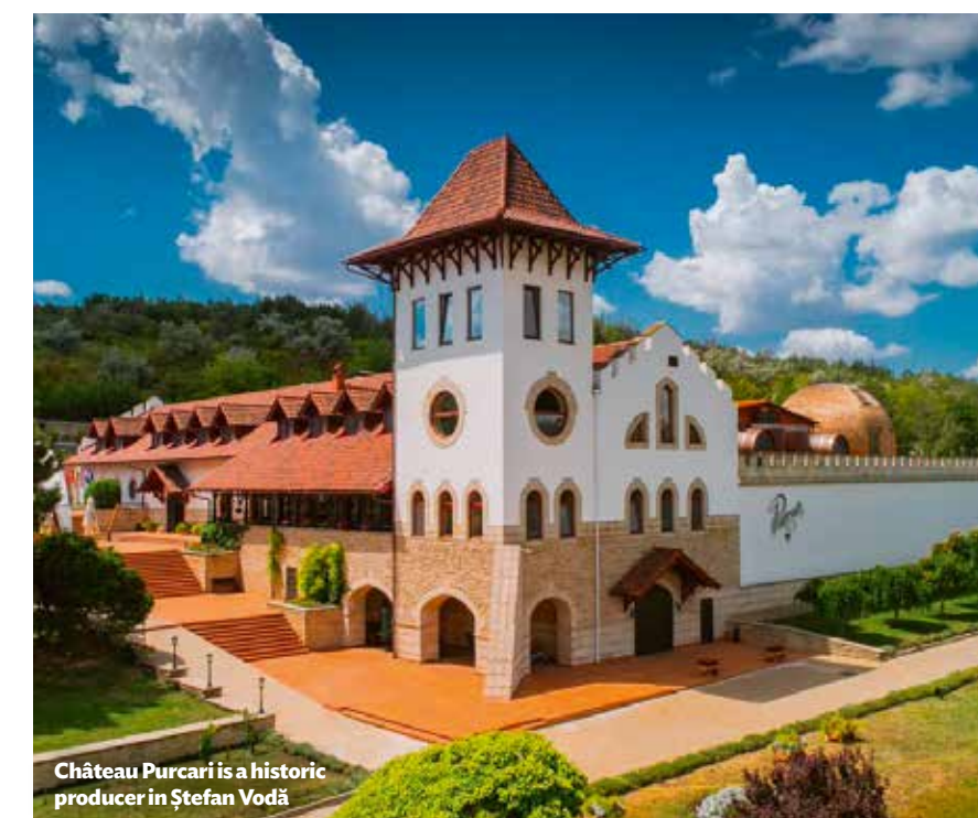
Château Purcari is a historic producer in Ștefan Vodă

For reds, Rară Neagră – which I see as somewhere between a Pinot Noir and a Gamay – is made both in fresh, vibrant, lighter styles as well as oak-aged expressions, and is well-suited to carbonic maceration. At Château Purcari , they are experimenting with late-harvest examples as well as night harvesting to preserve freshness and acidity. I would pair a chilled glass of Rară Neagră with a traditional Moldovan savoury pastry, plăcintă . The wine’s red fruit works beautifully with the fluffy, buttery pastry and salty cheese fresh from the oven. This is a very food-friendly variety – the vibrancy of its fruit would also suit fish dishes.