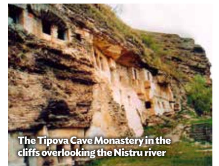
The Tipova Cave Monastery in the cliffs overlooking the Nistru river

admiring the scenery from the terrace, round off your Moldovan adventure with dinner and an overnight stay.