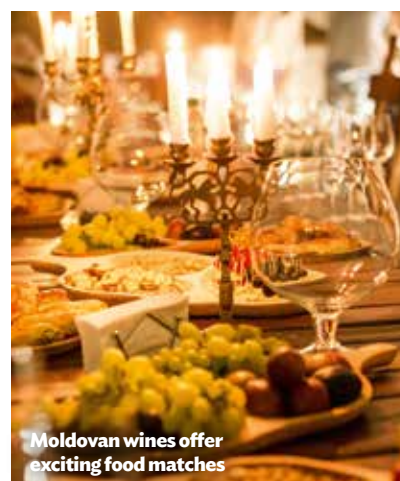
Moldovan wines offer exciting food matches

‘Growing up in a winemaking family in Moldova, Lungu learned firsthand about low-intervention winemaking’