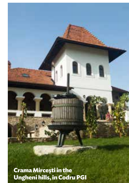
Crama Mircești in the Ungheni hills, in Codru PGI

I’d pair Viorica with traditional Moldovan fish dishes: lake fish fried in breadcrumbs or baked carp. It works beautifully with the oiliness, nice acidity and fruit balance of a dry or orange Viorica .