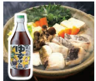
Yuzu Ponzu: For hotpots.