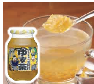
Yuzu cha: Dilute with warm water.