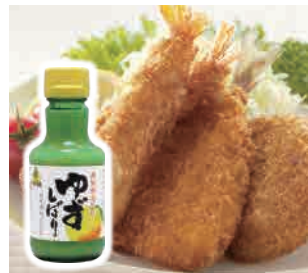
Yuzu shibori: With fried foods.