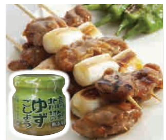
Yuzu gosho: For grilled chicken.