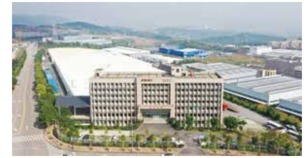
Headquarter of Senci Group