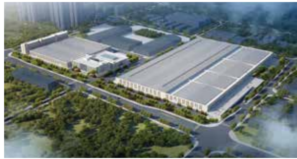
Shuitu Production Base