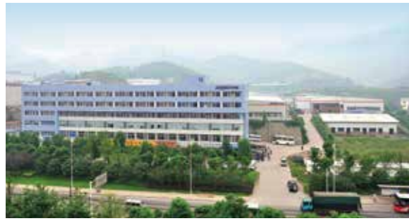
Tongxing Production Base