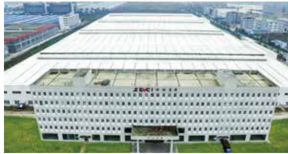
Tongliang Production Base