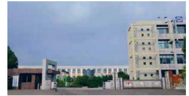
Sanhua Production Base