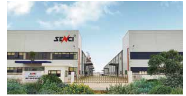
Vietnam Production Base