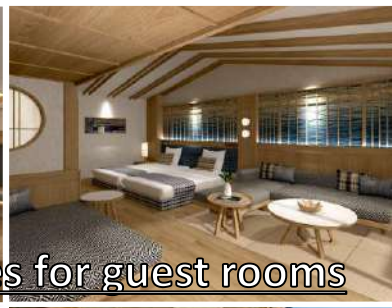
Rendering images for guest rooms