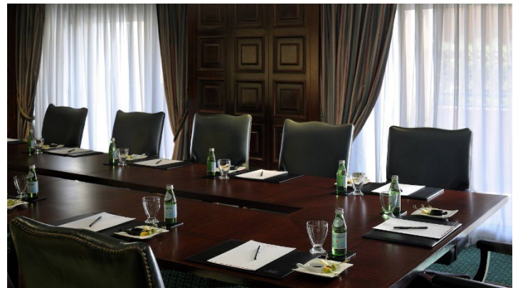
Farafra Meeting Room