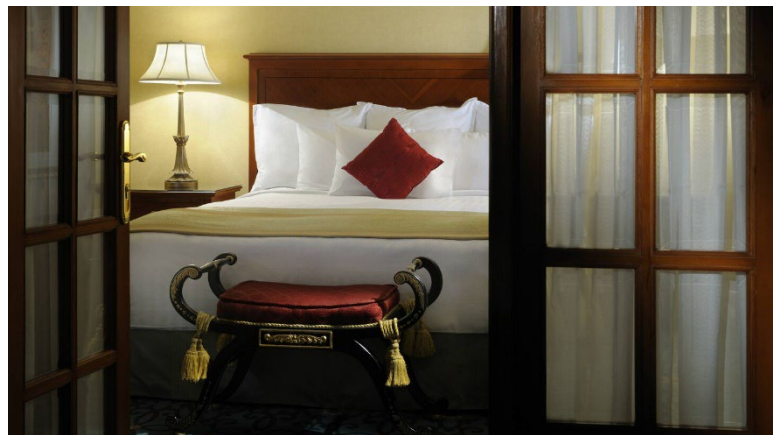
Diplomatic Suite Bedroom