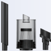
Vacuum Cleaning Kit