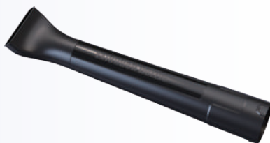
E01 Extension Nozzle & D01 Diffuser Nozzle