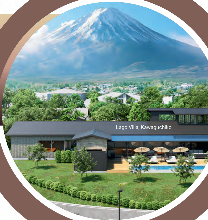
Lago Villa, Kawaguchiko

We have accommodations available throughout Japan, so please enquire regarding accomodation in other prefectures