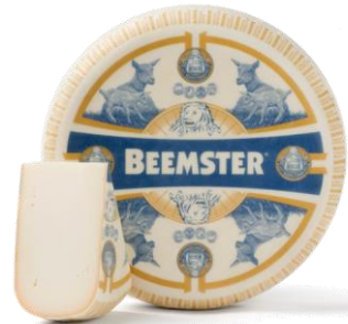
Beemster Goat Matured 4 months