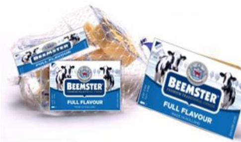
Beemster cheese bites vacuüm KLM inbound around the world