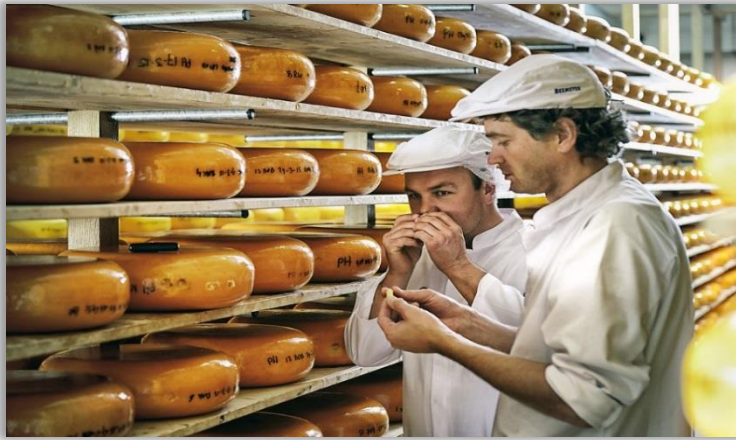
Natural aging in controlled environment