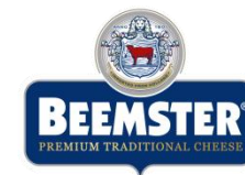
Beemster Cheese roll Hot snack Buy on Board Transavia