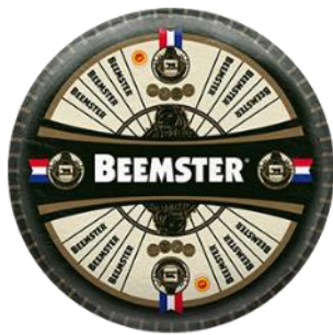
Beemster Signature Matured 12 months