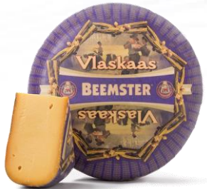
Beemster Vlaskaas Matured 5 months Sweet & Nutty