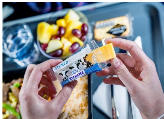
Beemster cheese bites flowpack Economy serving ICA KLM