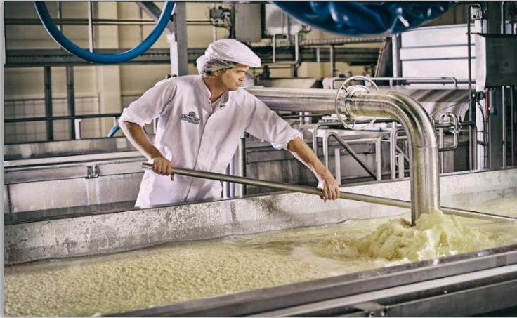
Manual stirring the curd