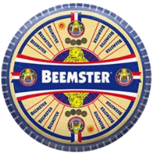
Beemster Farmers choice Matured 4 months