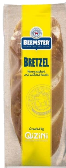
Beemster Bretzel Hot snack Economy serving Delta Air lines