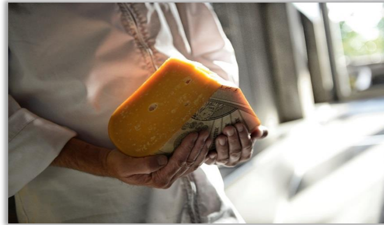
Controlled by cheese master