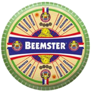
Beemster Mild Matured 1 month

Whole/quarter wheels for cutting cheese trays: