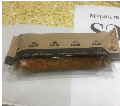
Beemster Bun, bread roll with cheese filling inside