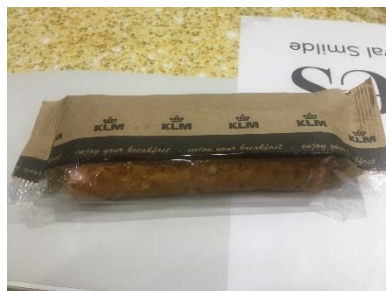
Beemster Bun Hot snack Economy serving KLM breakfast