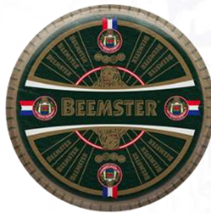
Beemster Classic Matured 18 months