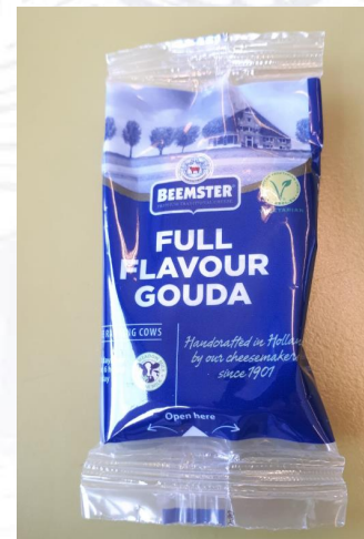
Beemster cheese bites Flowpack Gate gourmet NL/GER exclusive