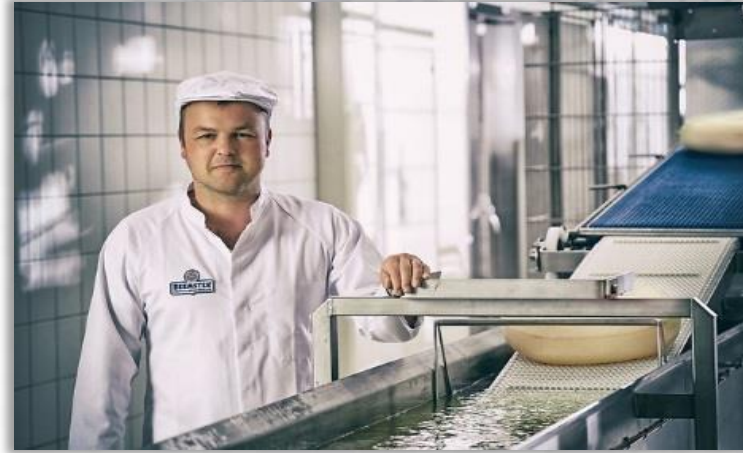
Special brine bath