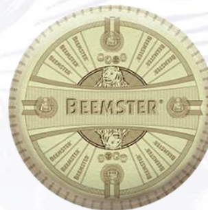
Beemster X-O- Matured 26 months