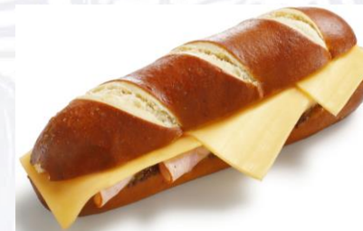
Beemster Bretzel, honey/mustard dressing and sun dried tomato