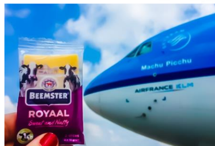
Beemster 2 mini slices Businessclass KLM Breakfast serving