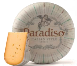
Paradiso Italian style Matured 10 months or vintage