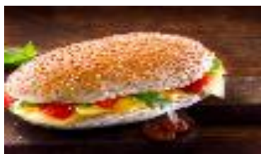
Double Beemster sandwich Buy on Board Tui Fly/Norwegian