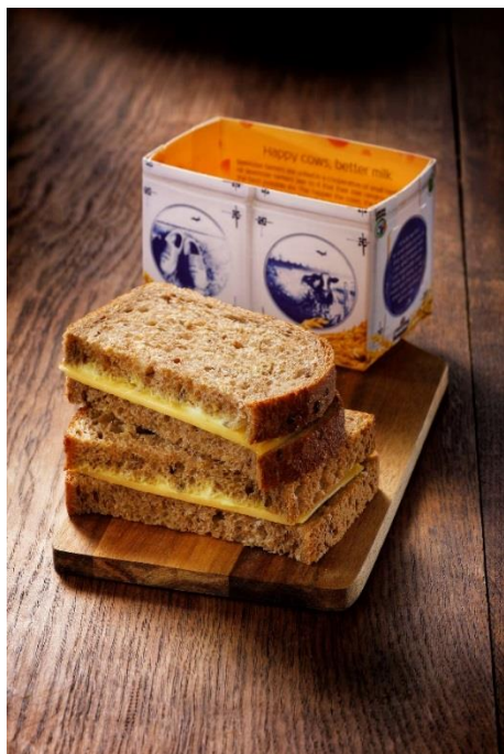
Beemster cheese sandwich Economy serving KLM