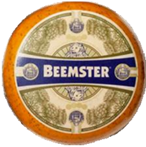
Beemster Herbs Leyden, Mustard, Garlic, Pepper, Smoked