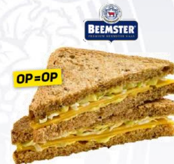
Beemster classic old Buy on Board Corendon