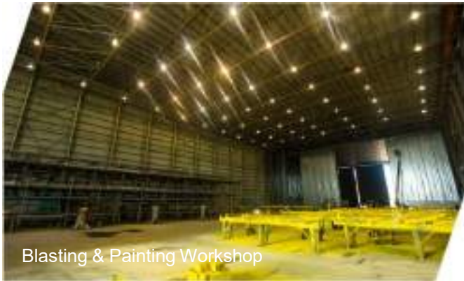
Blasting & Painting Workshop