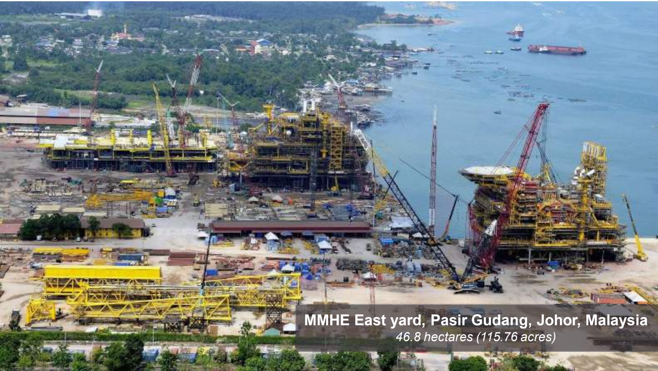
MMHE East yard, Pasir Gudang, Johor, Malaysia 46.8 hectares (115.76 acres)