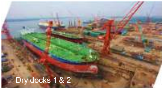
Dry docks 1 & 2