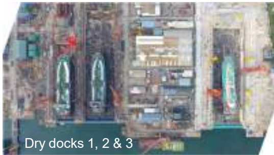
Dry docks 1, 2 & 3