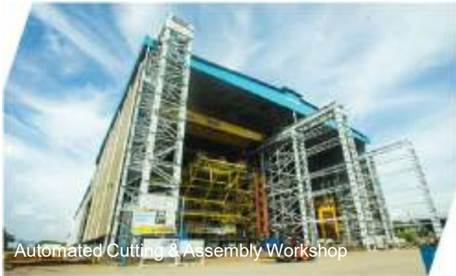
Automated Cutting & Assembly Workshop