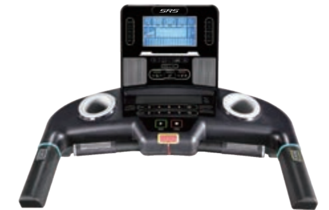
9" LCD ( blue backlit )