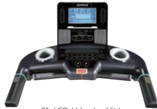
9" LCD ( blue backlit )