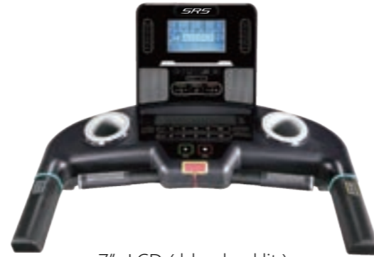
7" LCD ( blue backlit )