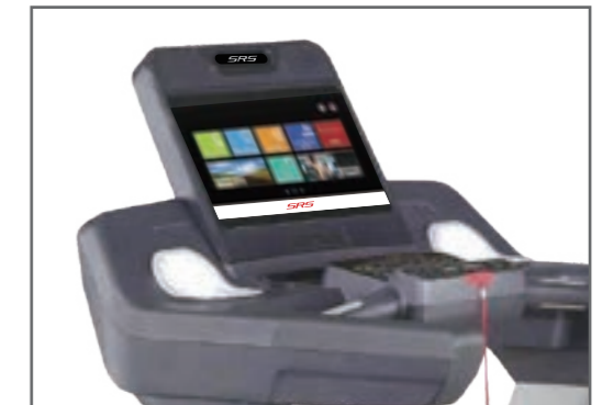
15.6" TFT ( blue backlit )