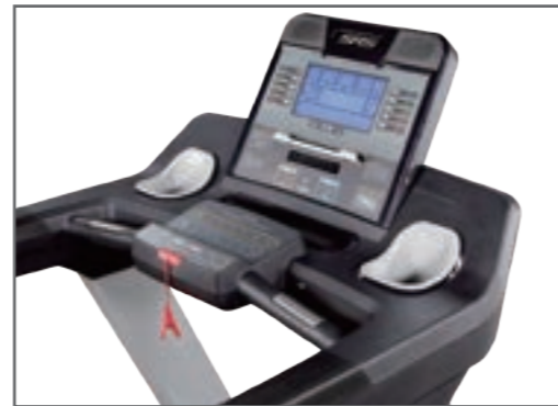
9" LCD + LED ( blue backlit )