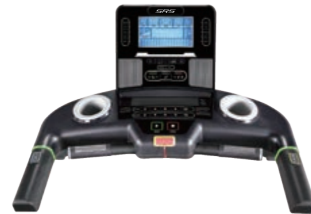
9" LCD ( blue backlit )