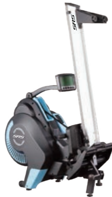
Patented Folding Design