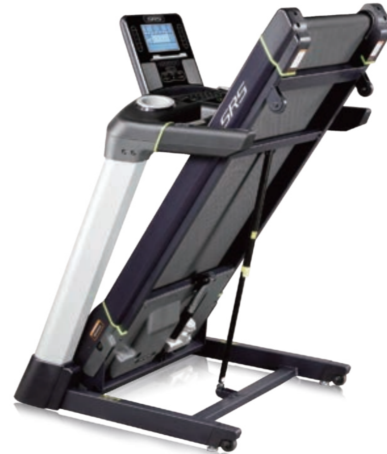
TD-732 / HOME Patented Folding Design