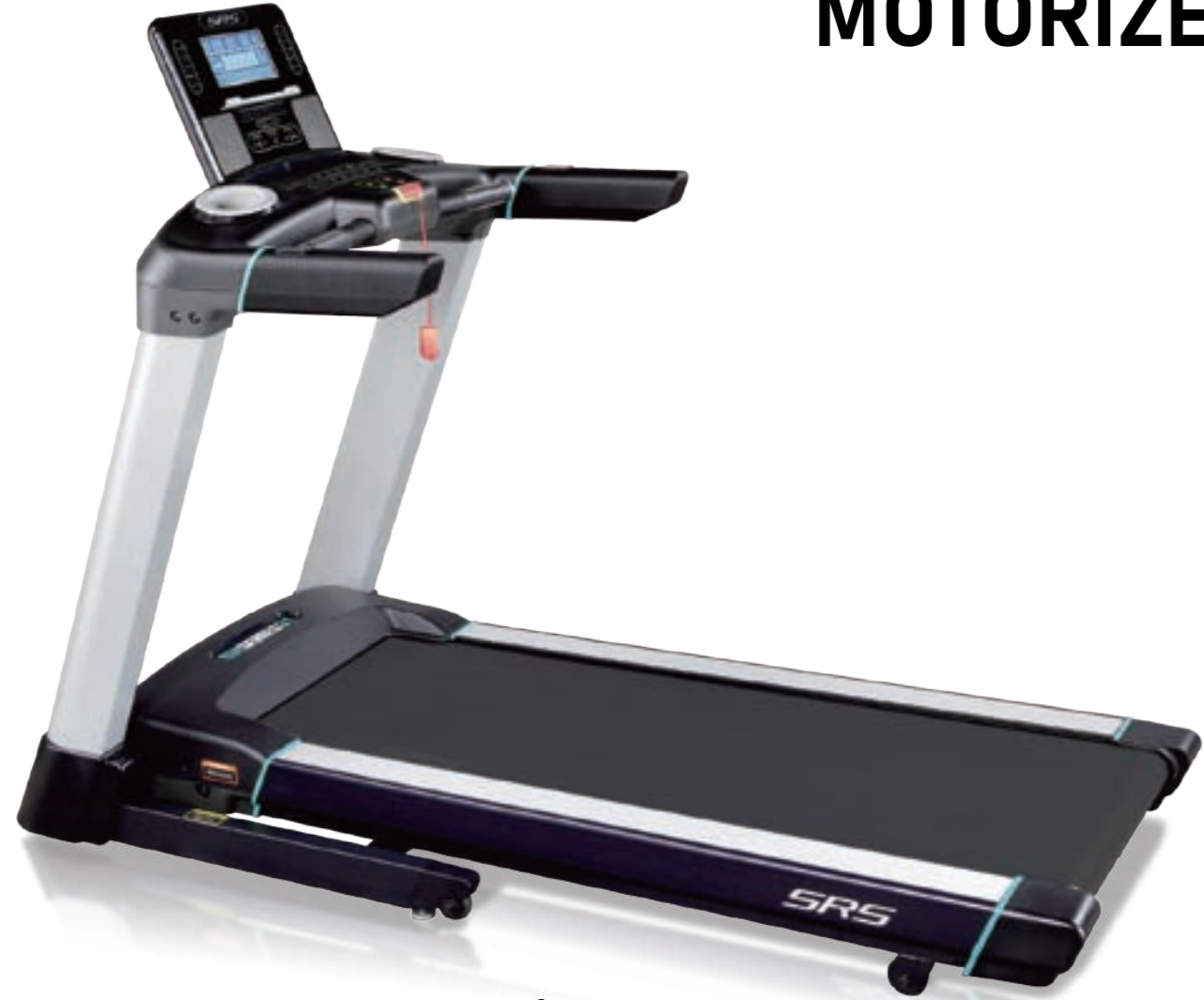
TD-731 / HOME Patented Folding Design