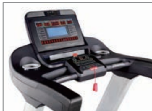
9" LCD + LED ( blue backlit )