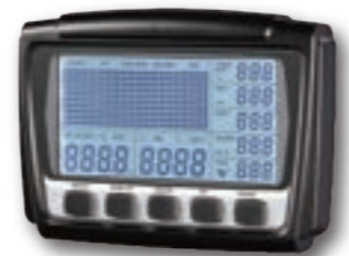
7" LCD + Backlit