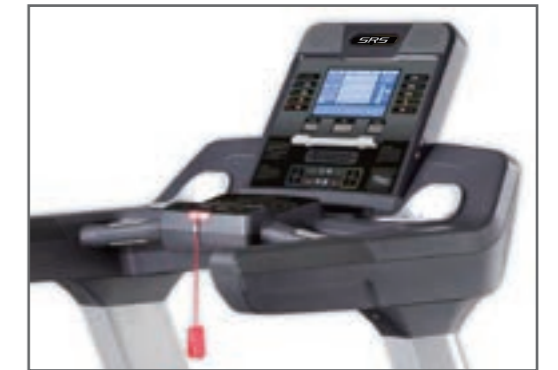
9" LCD + LED ( blue backlit )