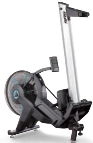
Patented Folding Design