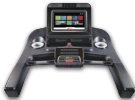
15.6" TFT ( blue backlit )