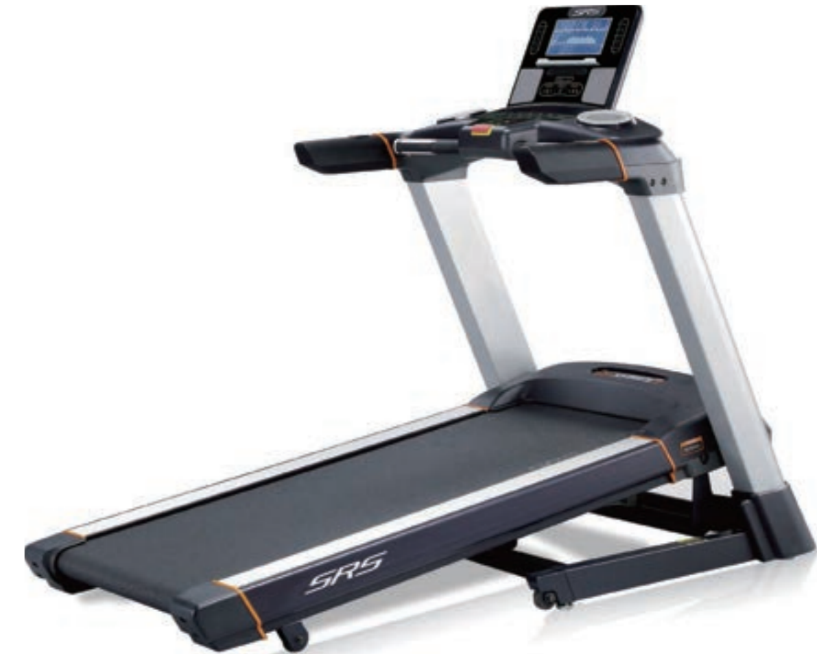
TA-760 / LIGHT COMMERCIAL Patented Folding Design