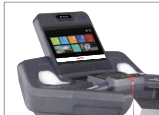
15.6" TFT ( blue backlit )